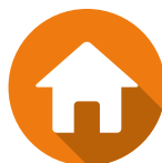
PERSONAL THIRD-PARTY LIABILITY & RENTAL CIVIL LIABILITY