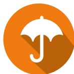
DEATH & DISABILITY